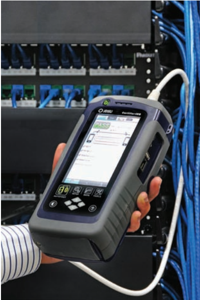
Superb ease of use with large graphical touch screen