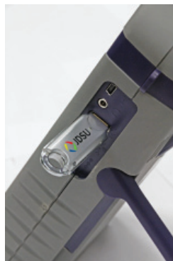
USB Flash Drive support to transfer test results