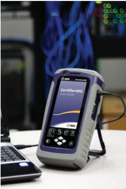
Complete PC desk reporting software