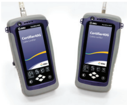
Two complete units to minimize time spent initiating, naming, and saving results

*Please specify regional cables: North America (NA) Type A, European (EU) Type C, United Kingdom (UK) Type G, Australian (AU) Type I.