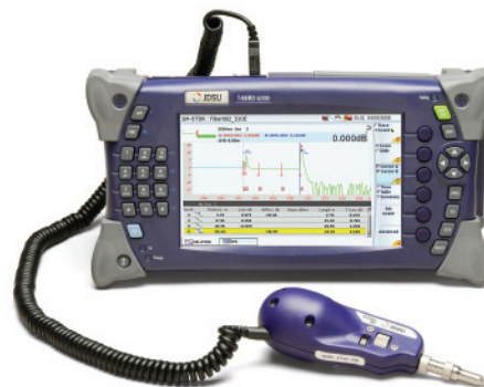
For more fiber testing and certification capabilities, combine the Certifier40G with one of the market-leading fiber testers from JDSU, such as the T-BERD/MTS-4000 with Quad OTDR.