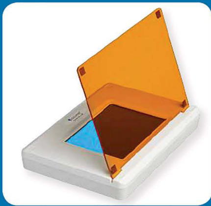
Amber cover raised for easy gel access

An array of super bright LEDs with a long, 30,000 hour service life provide the light source for the SmartBlue Transilluminator. Unlike those in a UV transilluminator, the filters in the SmartBlue will not solarize and degrade in performance over time. Gel bands can be excised directly on the scratch resistant, glass viewing surface. To save energy, the power switch includes an automatic 5 minute shutoff. The SmartBlue Transilluminator is covered by a 2 year warranty.