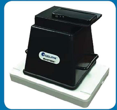
Use with SmartDoc™ for gel imaging with a cell phone