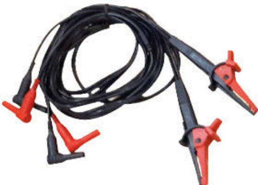
6 ft CAT IV 300 V rated compact kelvin clips, 4 mm shrouded plugs