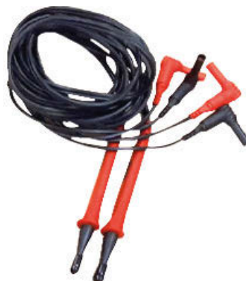
6 ft CAT IV 300 V rated compact kelvin probes, 4 mm shrouded plugs