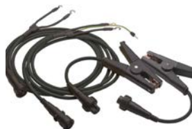
+ KC1 Kelvin clip 3 m leads + No test leads supplied