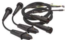
+ DH4-C probe 1.5 m leads