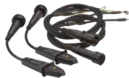
+ DH4-C probe 1.5 m leads