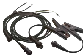
+ KC1 Kelvin clip 3 m leads