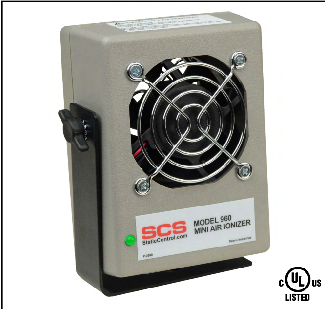
Figure 1. SCS 960 Mini Air Ionizer